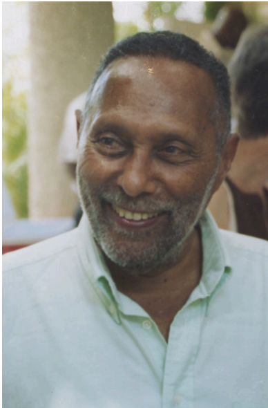
Stuart Hall.

“The Stuart Hall Archive Project is a major multi-disciplinary research project that will expand public understanding and engagement with the work of the celebrated cultural theorist, Professor Stuart Hall. ”