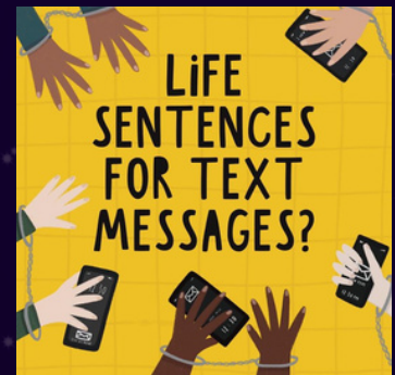
Image description: black text “Life sentences for text messages?” on a yellow background. Multiple pairs of children’s hands of different colours, each pair handcuffed, reach inwards. Some of them are holding mobile phones.

The appeal outcome is due in January 2025 . Find out more and what you can do to support the boys via Kids of Colour’s statement , and their comprehensive Twitter thread on the case .