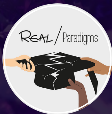
Image description: illustration showing three hands - one dark brown, one lighter-brown, and one light-skinned, pulling apart a mortar board graduation cap. Above it is written REAL/Paradigms.

Image description: picture of a quote from the posted article; hand-written in black marker, it reads: "Rest is what we make possible through resistance..." - Trey Washington"