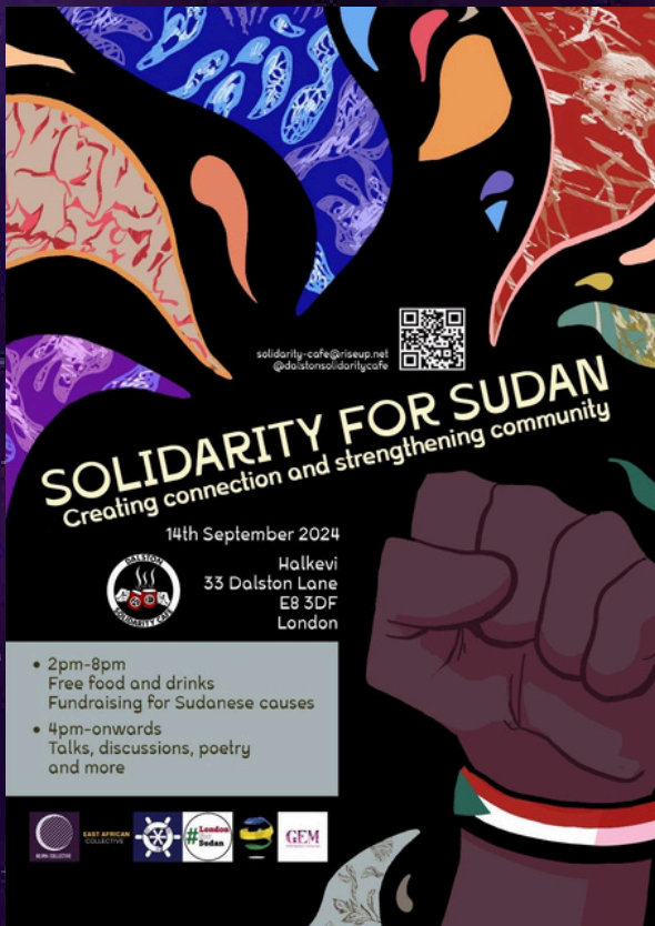
Solidarity for Sudan poster provided by Dalston Solidarity Cafe