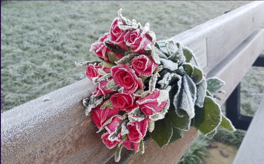
Image description: A bunch of red roses attached to the back of a park bench, on which you can just see part of a memorial plaque behind the flowers. The bench, flowers, and grass in the background are all covered in frost.

The ways we remember Oluwatosin Daniju, Tonbridge, Kent, 2021