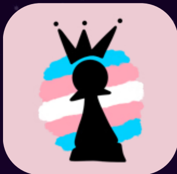
Image description: graphic of a black pawn on a stylised circular trans flag – horizontal stripes of turquoise, pink, white, pink and turquoise. It is on a paler pink background.

Image description: black text “Life sentences for text messages?” on a yellow background. Multiple pairs of children’s hands of different colours, each pair handcuffed, reach inwards. Some of them are holding mobile phones.