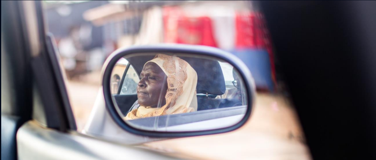
Rear View by Wasi Daniju.